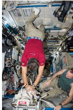
Figure 2 56

Research in space medicine is ongoing, but it is hindered in part by environment and in part by a lack of available research. Much of the needed research is, in turn, limited by current capabilities and risk assessments towards human health. 57 Eventually, risk standards will need to be less strict if astronauts are to undertake long-duration missions. Emergency medicine may offer a model as to how risk can be managed during a long-duration flight.